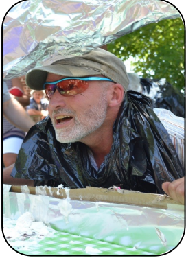
Drivers participates in our Pie a Guy fundraiser!

Thank you to our drivers who volunteered for our “Pie a Guy” fundraiser!