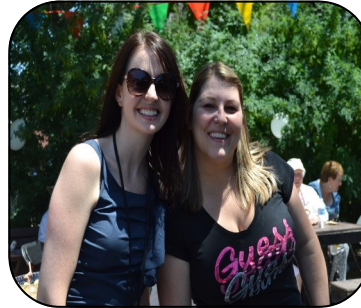
OWCS AIP outreach workers stop by the BBQ for a visit!